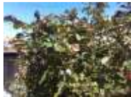
Plantings that are not regularly maintained on one side will eventually take over both sides.

The Garden/Landscaping policy is available on the PVHA website: It can be viewed in its entirety by clicking the link below.