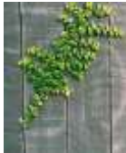
The start of encroachment. (Over the fence and through the cracks)

Vines must not be attached to any exterior building surfaces or common area fences. They can be trained to grow on a trellis; however, it must not be attached to the fence.