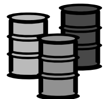
55 & 30 gallon barrels or drums